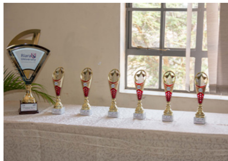
A display of the trophies that were won at the event.