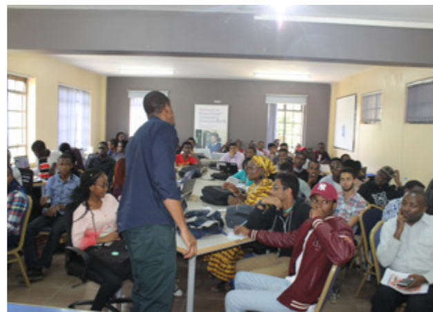
A section of the participants at the forum.