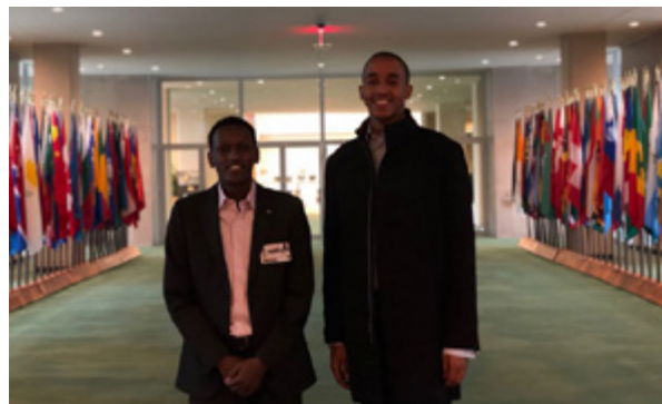
Top right and bottom left: Riara University Students who were present at the event.