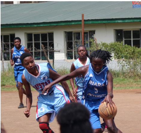
RU Scarlets at a recent NBA league game at Upperhill Secondary where they trounced Daystar Uni to clinch the top spot in their table.

The semester ahead looks absolutely fabulous as all the leagues enter phase two of their fixtures. All the teams are excited as they look forward to engagements that could see them travel out of out of Nairobi for engagements. The sky is no longer the limit.