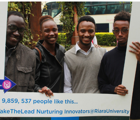
9,859, 537 people like this... TakeTheLead Nurturing Innovators@RiaraUniversity