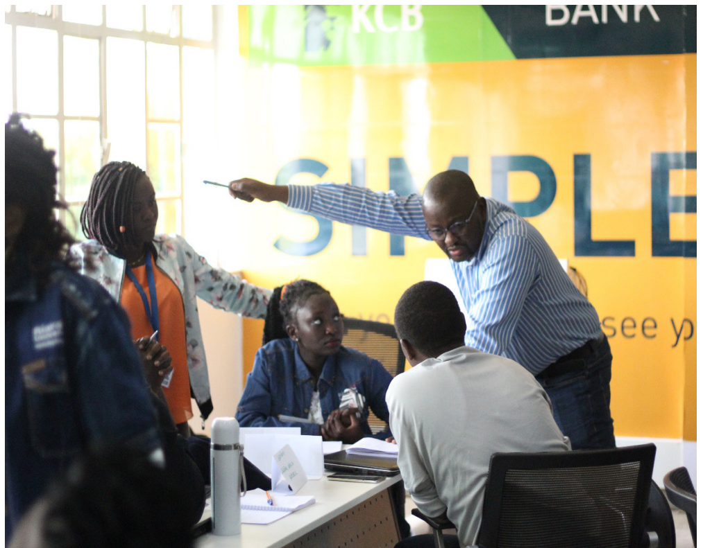
TOP LEFT: An RU Student at the event.