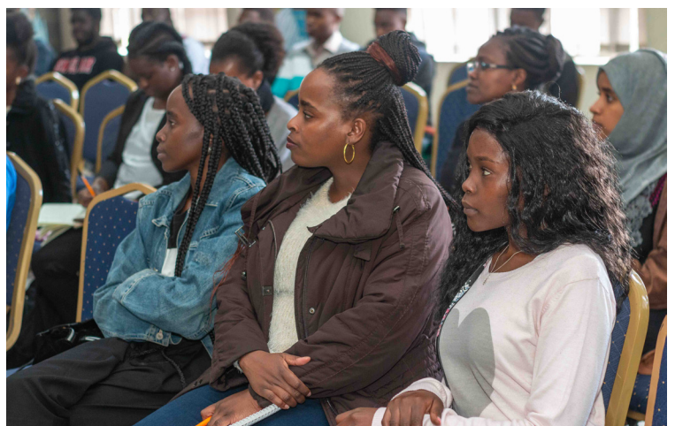
BOTTOM: A section of the participants and students present at the function.