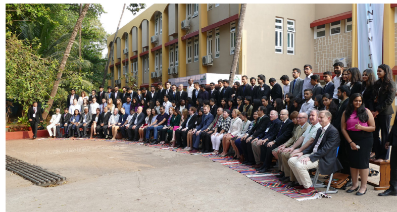
A group photo of the participants during the Lex Infinitum International Dispute resolution competition in Goa, India.