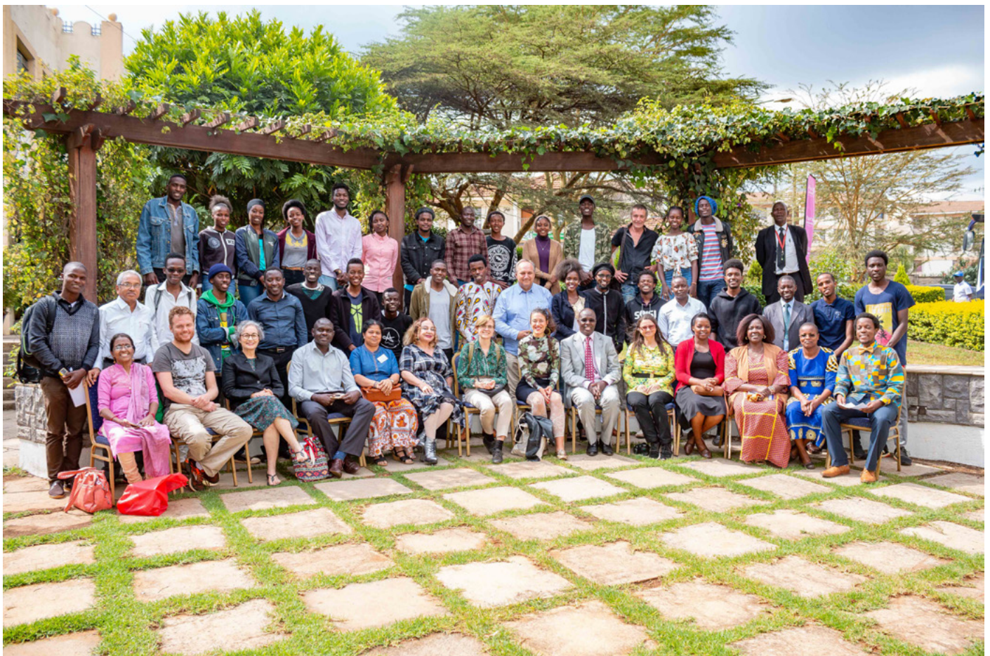
Poets, Musician Artists, Spoken word artists, Staff, Students together with our participants in a group photo.