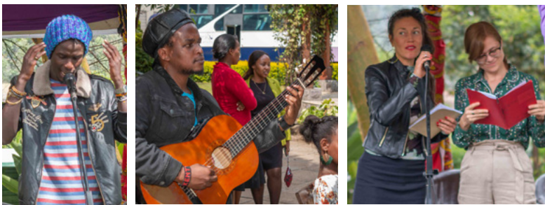
Various artistes make presentations at the Festival.